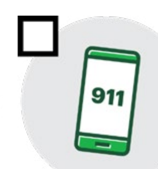
Step 2: If someone's hurt. call 911.