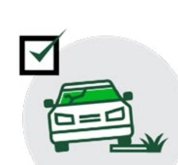
Step 1: If it's safe, move your car to the nearest curb.