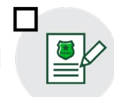
Step 3: Report the accident to police.